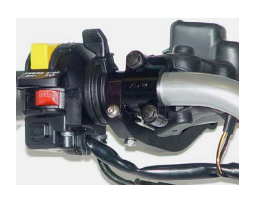
Right side view of ATV, bracket is positioned under brake lever and angles toward center.

When mounting the handguard to the bracket, make sure the no-spin spacer is positioned so that the pin goes into the back hole of the bracket and the bolt goes through the front hole. Also make sure the no-spin spacer is positioned so that its tabs go over one of the handguard tabs as in the Option photos below.