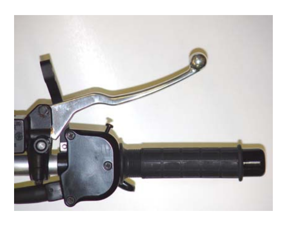
Photo 2 - top view of ATV Throttle, bracket is positioned under the brake lever and angled toward the center.

STEP 3: Insert the M6 x 25mm hex head bolt through the bracket and thread into the strap. This adjustment screw is used to achieve the desired tightness of the mount. Leave the bracket loose enough for now so you can adjust the position up or down after attaching the hand guard to the bracket.