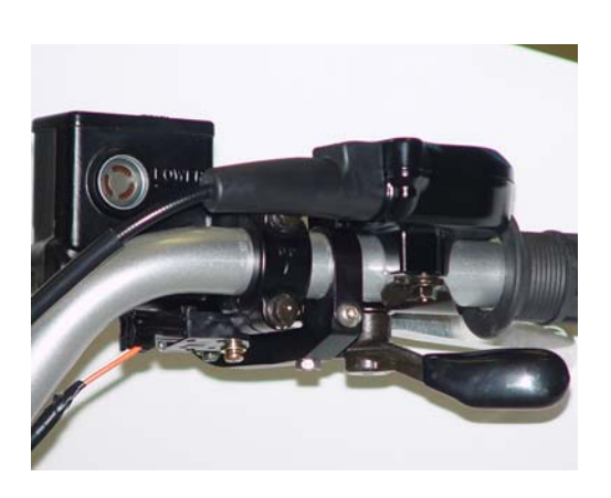
Rear view of ATV throttle, mount bracket is positioned under brake lever.